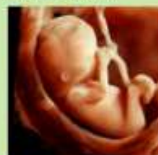
Left: 3D/4D Ultrasound Image