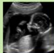
Right: Old 2D Ultrasound Image

The purpose of the site assessment is to ensure that the medical clinic is operating with the highest standard of excellence and providing medical services built on a strong foundation. The overwhelming news is that Focus on the Family granted Douglasville's PRC Medical two 3D/4D ultrasound machines!