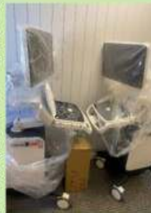
Two new 3D/4D Ultrasound machines

Some months ago PRCM applied for a grant from Focus on the Family (Optional Ultrasound Program, OUP) for a new ultrasound machine since the software on ours was 20 years old. Focus on the Family did a two-day audit and site assessment on our medical clinic to qualify us for the grant.