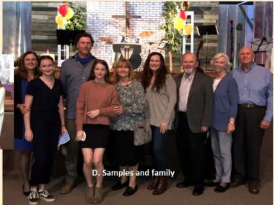
D. Samples and family